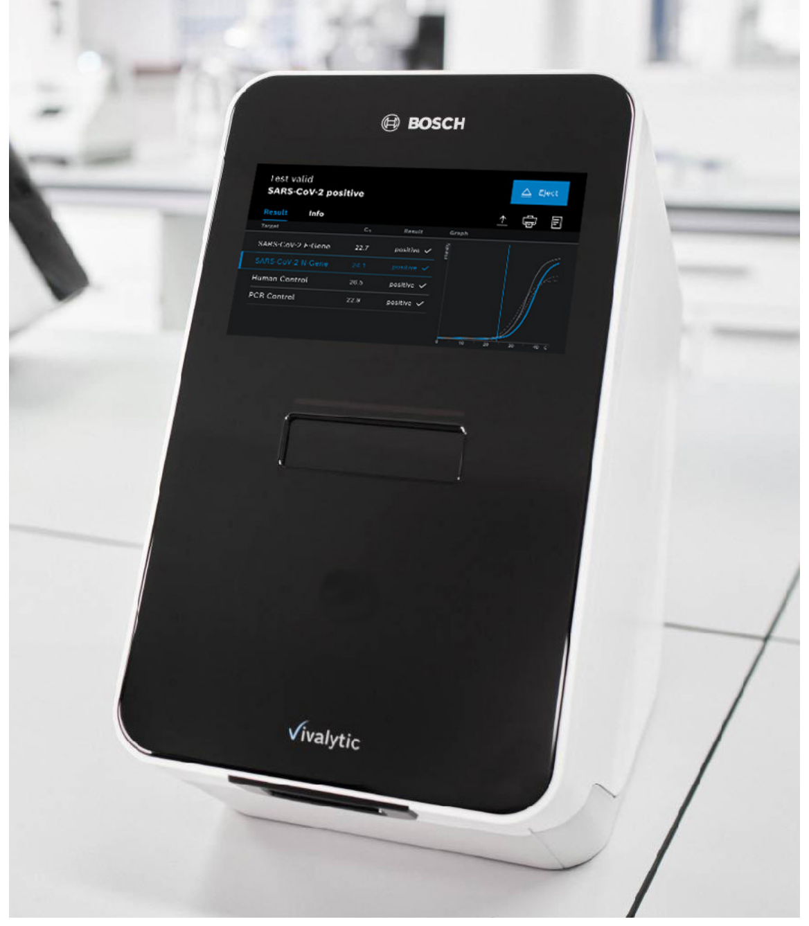
On the Vivalytic Analyser the detection of pathogens is displayed in form of an amplification curve.